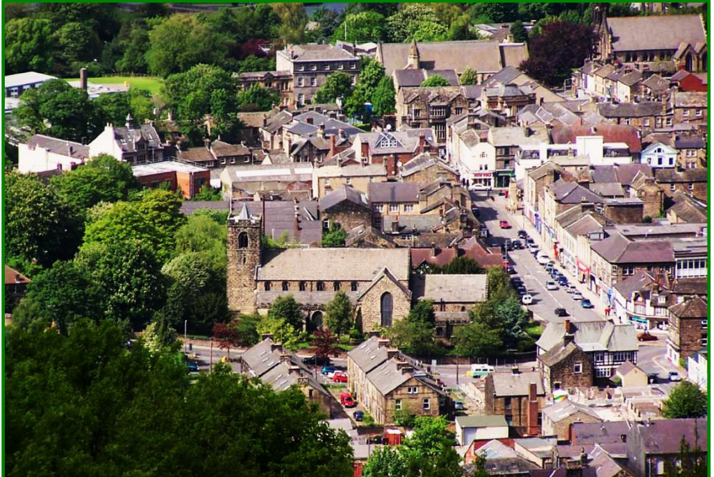
Aerial view of Otley Town Centre

On the second Saturday of each month starting on 9th May 2026, Otley Parish Church will be organising two free events to help people engage with the wonderful heritage of Otley, and also to discover more about the history of the oldest building in the town.