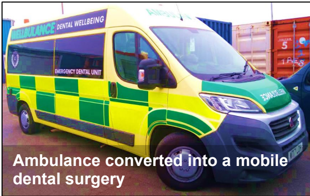
Ambulance converted into a mobile dental surgery

We have been many times since 2012 to the Refugee Community Kitchen (RCK) where meals for up to 600 people are prepared and cooked each day. This time we went with a lovely group of people who volunteer, serving the